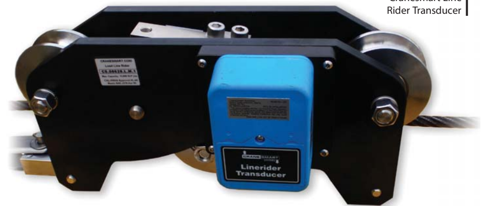
Cranesmart Line Rider Transducer

Cranesmart Systems has provided many custom units for unique applications. We strive to meet any crane safety challenge put forth by our customers, including large capacity cranes, line riders, load pins, and non-crane applications.