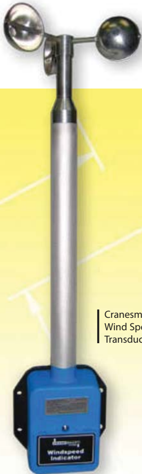
Cranesmart Wind Speed Transducer

The Cranesmart System is the most reliable and maintenance-free crane safety equipment in the industry.