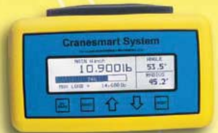
Cranesmart anti-2-block system

Our products meet or exceed the requirements set forth by ABS, ANSI, API, ASME, CALOSHA, CE, City of New DNV, FCC, OSHA, SAE, U.S. Army Corps of Engineers, U.S. Coast Guard, UL, U.S. Navy, and others.