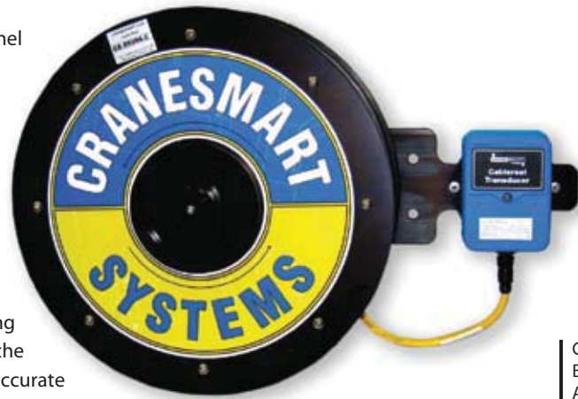
Cranesmart Boom Length/ Angle Transducer

BUILT RUGGED & WATERTIGHT: Our marine system is proven in salt-water environments. Components are built rugged and are environmentally sealed to ensure reliable operation through weather and usage extremes.